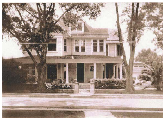
Hewes House - Circa 1950. Showing the original location of the house adjacent to Main Street.

The now vacant lot on the corner of Main and Henkle Streets, formerly occupied by a filling station, has been acquired by the Landmark Society. The effort to acquire the lot has been ongoing since the inception of the project and acquisition of the lot was considered crucial to the success of the project. The Hewes home was originally built on the lot and later moved to its present location, so the integrity of the original homesite has been restored.