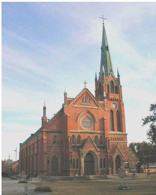
and the construction of the church building as it stands today.

Louisiana Historic Marker in the foreground of the above picture commemorates the founding of the church parish